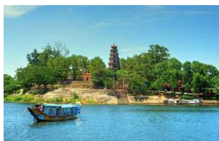
Thien Mu Pagoda