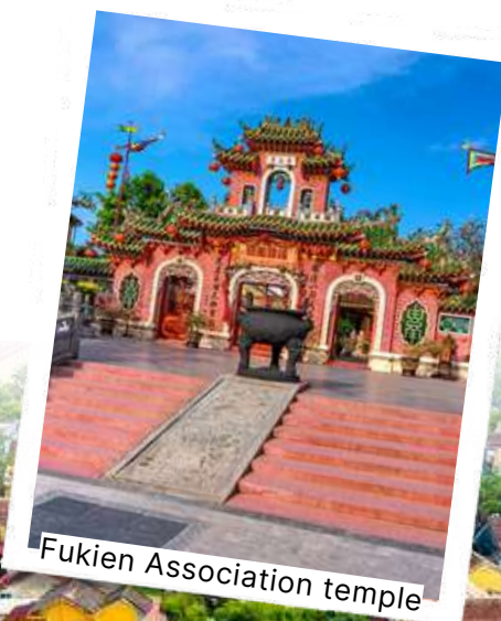
Fukien Association temple

Suggested flight: AK648 KUL DAD 10:15 11:50 (Airfares excluded)