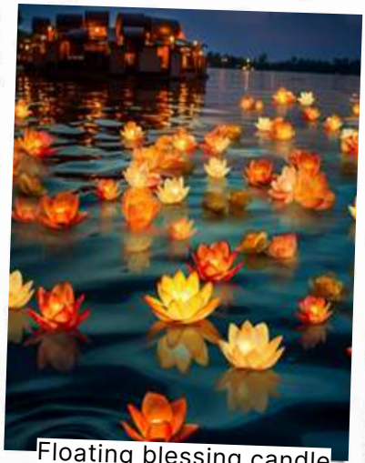
Floating blessing candle on boat