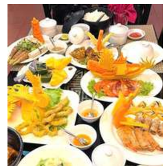
Hue Royal Meal

Meals Breakfast at hotel Lunch and dinner at Vietnamese restaurant